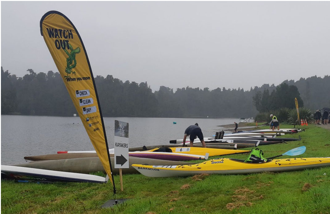
Check, Clean, Dry flag at Lake Kaniere Triathlon

and spent several hours visiting popular waterbodies reaching freshwater users and promoting good cleaning practices in hopes to reduce the spread of aquatic invasive species.