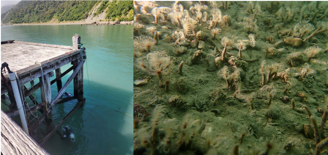
Photo of the divers conducting the scan of the pier and picture of the unknown species of fan worm.