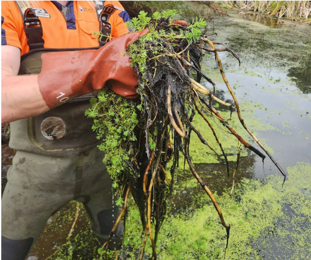
Image three: Parrots feather root mass. Parrots feather is a serious threat to drainage on the West Coast

DOC is continuing to monitor a historic site in Greymouth and is managing a site in Birchfield's wetland. Additionally, a further site at Gillows Dam is being managed privately, moving forward it will be managed by three landowners including DOC. WCRC have requested to be kept up to date and are providing technical advice. Staff have been instructed not to visit a historic site near Westport until safety concerns are addressed and its status remains unknown.