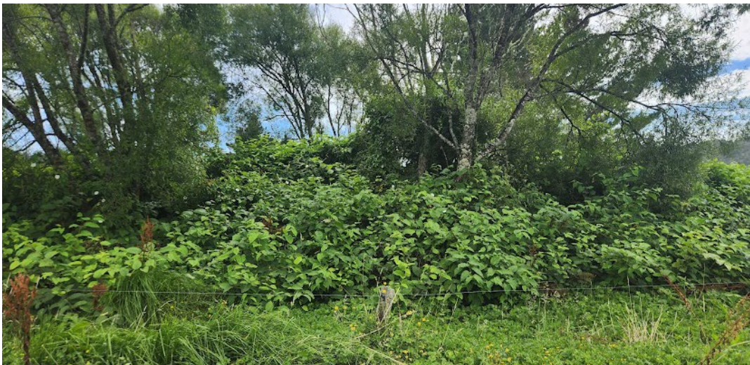
Knotweed invading forest understory.

This pest plant surveillance data will be assessed at the end of the financial year and options will be presented to council on how to best manage pest plant pathways and localised infestations moving forward. The GIS system will be instrumental in this process, providing staff and councillors with a regional picture of weed presence informing control. As more data is collected and mapped biosecurity action will become more informed.