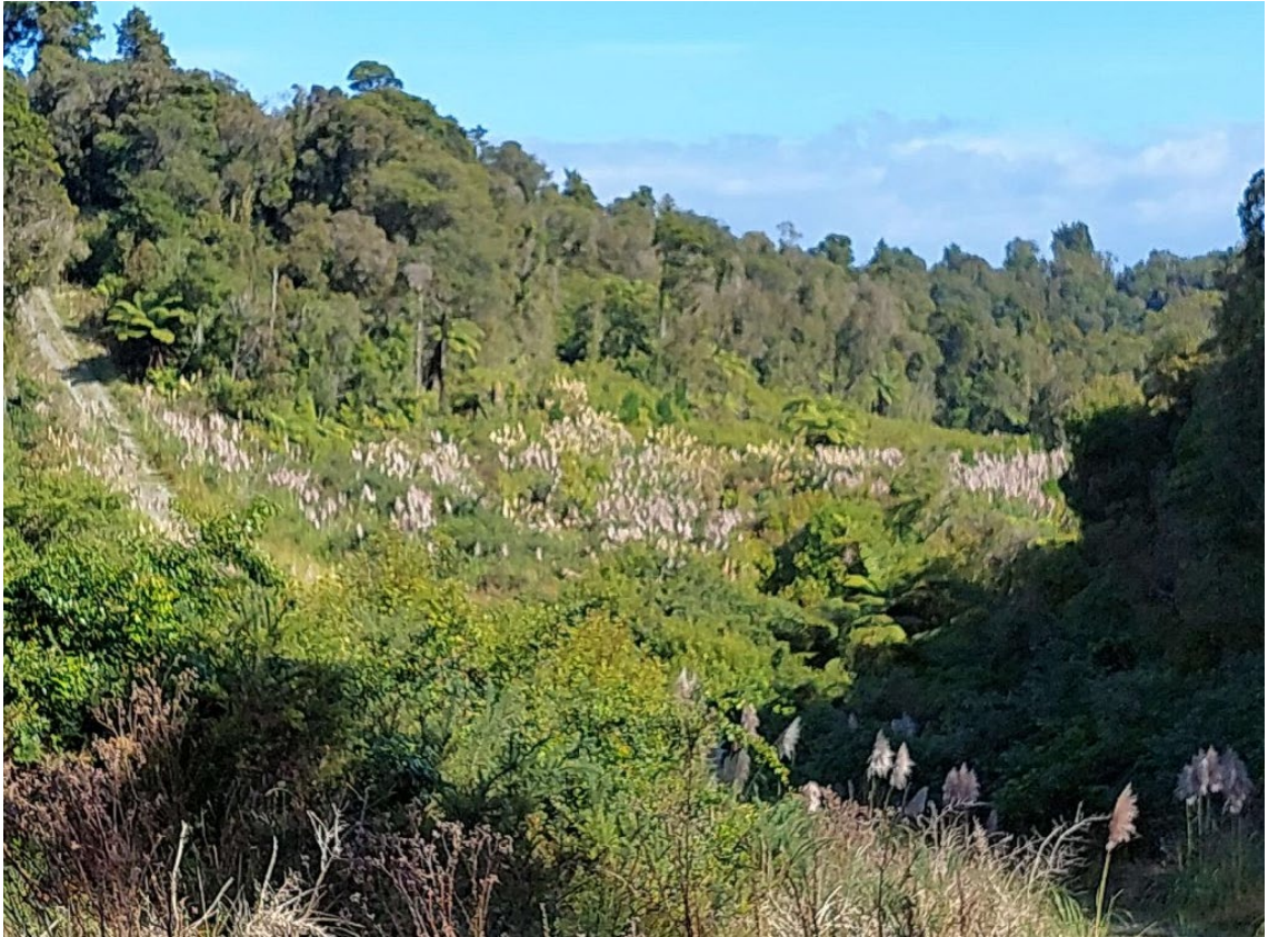
Image 1 Purple pampas on ex forestry land. This is one of the worse infestations on the west coast but should be possible to progressively contain to low levels. Purple pampas is a production pest on plantation forestry, and will slow the regeneration of cleared forest.