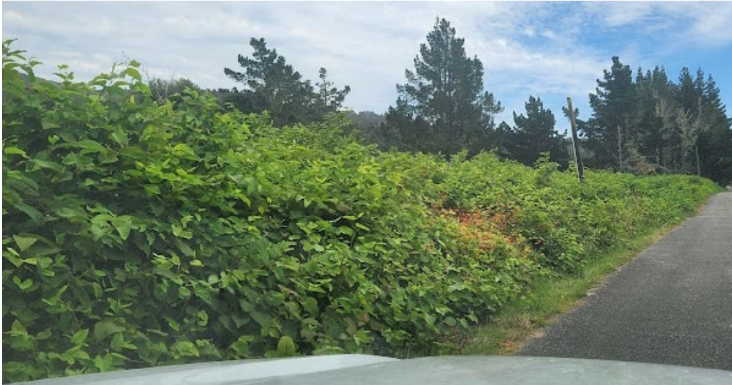
Knotweed (~2.5m height) overtaking the roadside